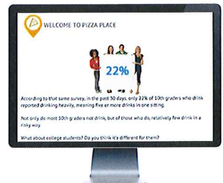
Using Social Norms Data To Achieve Behavior Change